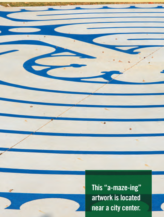
This "a-maze-ing" artwork is located near a city center.

win a prize Guess the location of this scene found within Walton EMC's service territory. We'll draw from the winners of all correct guesses for a $25 gift card.