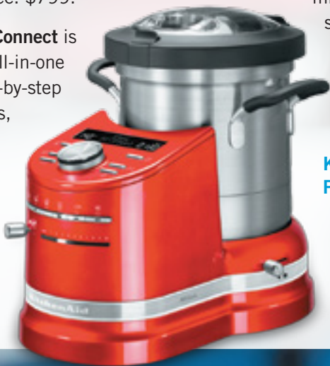
KitchenAid Cook Processor Connect

KitchenAid Cook Processor Connect is an intelligent and versatile all-in-one appliance that provides step-by-step recipe guidance while it boils, fries, steams, stews, kneads, weighs, chops, minces, purees, mixes, emulsifies, whips and stirs. Available: Fall. Price: $1,500.