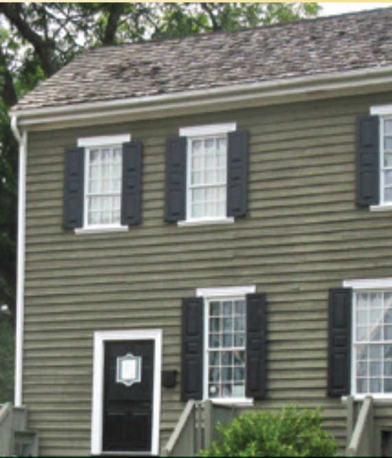
Legend is that this establishment, built circa 1800, is why the University of Georgia decided to locate down the road in Athens.

win a prize Guess the location of this scene found within Walton EMC's service territory. We'll draw from the winners of all correct guesses for a $25 gift card.