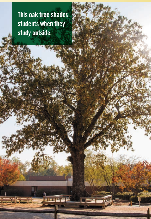
This oak tree shades students when they study outside.

win a prize Guess the location of this scene found within Walton EMC's service territory. We'll draw from the winners of all correct guesses for a $25 gift card.