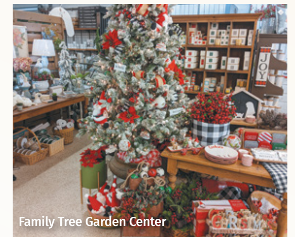
Family Tree Garden Center