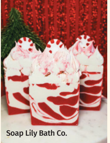
Soap Lily Bath Co.