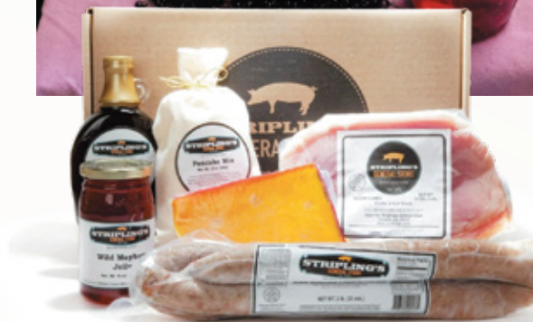
Stripling's General Store