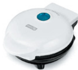
Dash Mini Electric Round Griddle