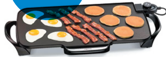
Presto Ceramic 22" Griddle