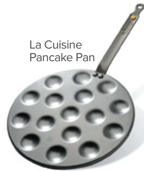
La Cuisine Pancake Pan