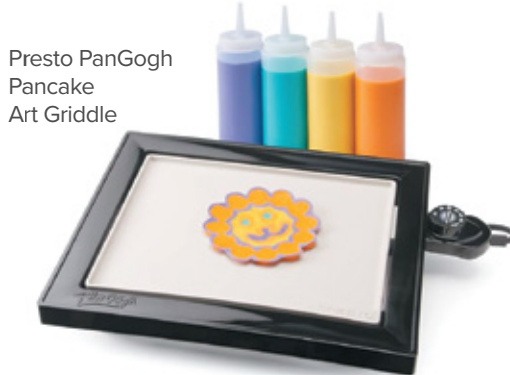
Presto PanGogh Pancake Art Griddle