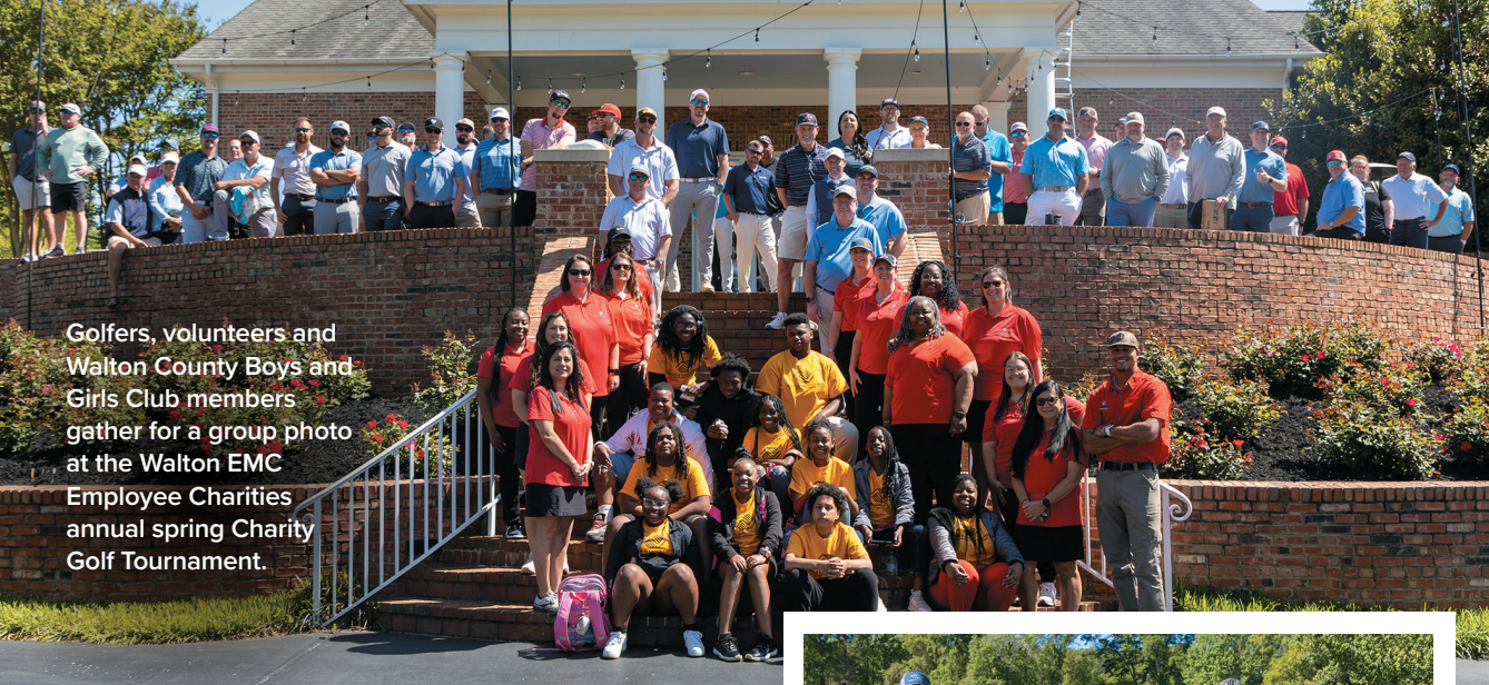
Golfers, volunteers and Walton County Boys and Girls Club members gather for a group photo at the Walton EMC Employee Charities annual spring Charity Golf Tournament.